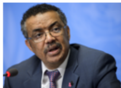
Dr Tedros Adhanom Ghebreyesus, WHO

The vision of the Sustainable Development Goals is a world in which no one is left behind, including people who suffer from rare diseases. Just because a disease affects a small number of people does not make it irrelevant or less important than diseases that affect millions.